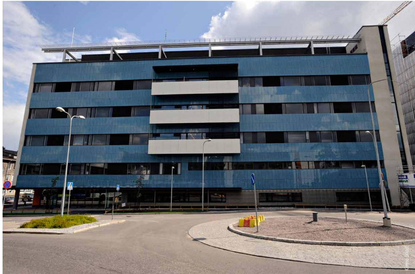
Maria Hospital moves to the new Haartman Hospital in Meilahti district, address Haartmaninkatu 24, building 12. The emergency services open in Haartman Hospital on Thursday 24 September.

Information about swine flu, see next page