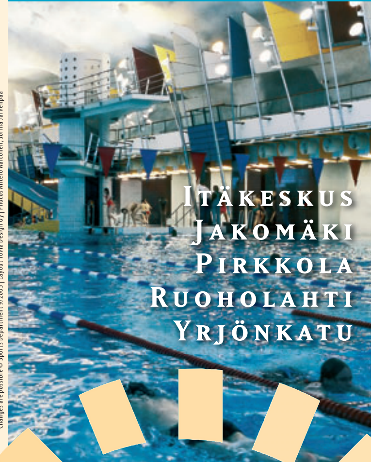
Changes are possible © Sports Department 9/2005 | Layout Tovia Design Oy | Photos Antero Aaltonen, Jorma Järvenpää

ITÄKESKUS JAKOMÄKI PIRKKOLA RUOHOLAHTI YRJÖNKATU